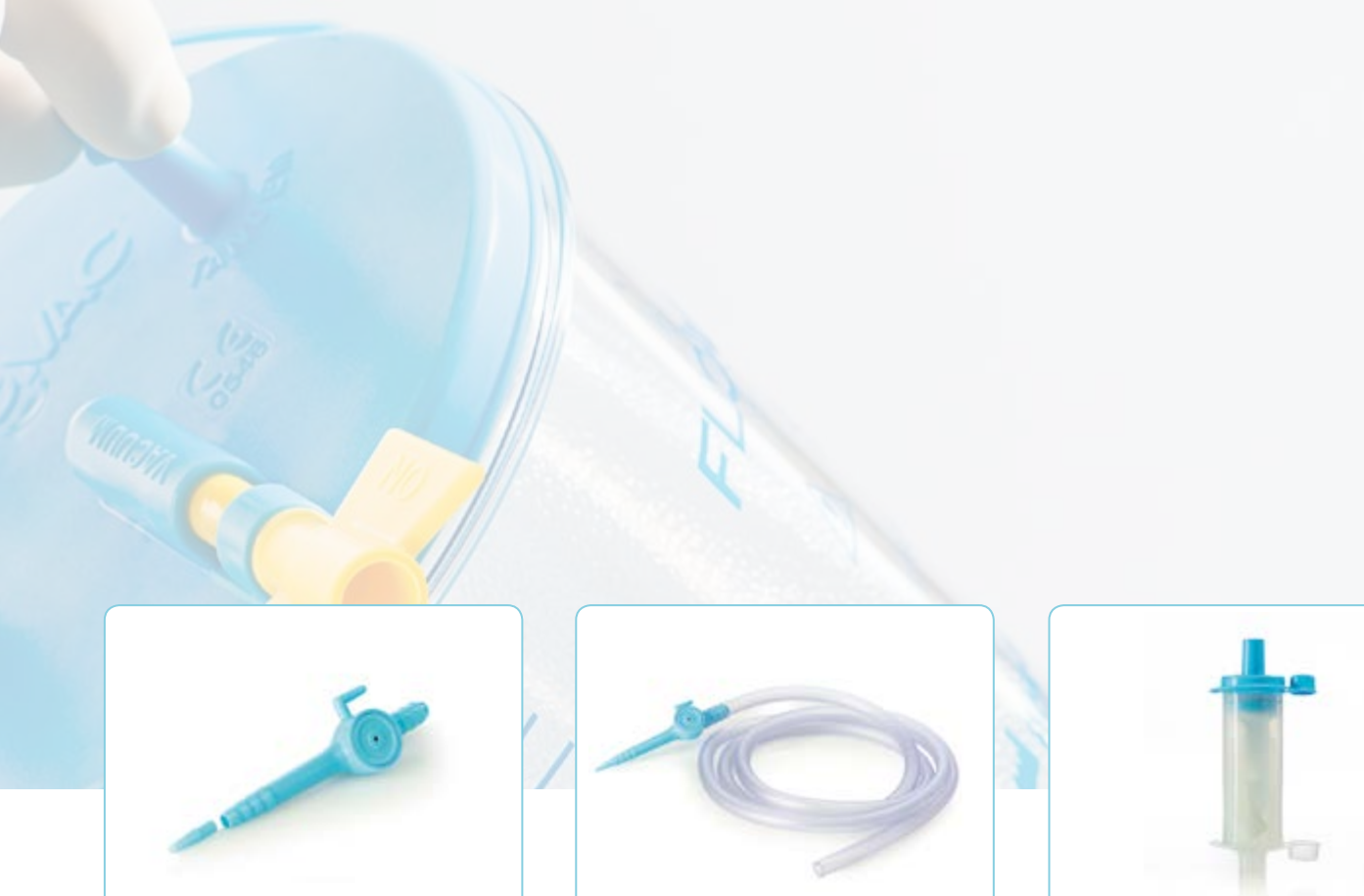
Disposable VACUUM breaker. 50 pieces/box