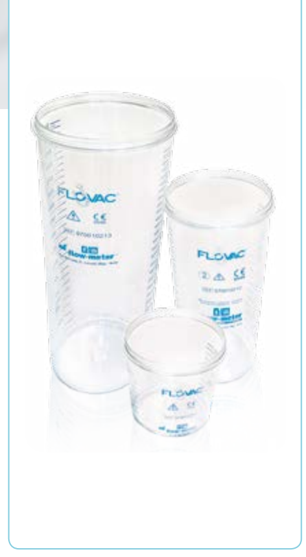
Reusable support jars (LINER version) 1.0 L, 2.0 L, 3.0 L in polycarbonate, autoclavable.