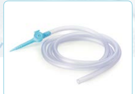
Hose Ø 7.5x11.2 mm - L=1.8 m with disposable VACUUM breaker. 100 pieces/box