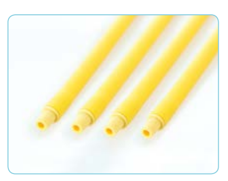
Hose Ø 7.5x11.2 mm - L=0.38 m with connector to supply the VACUUM port.