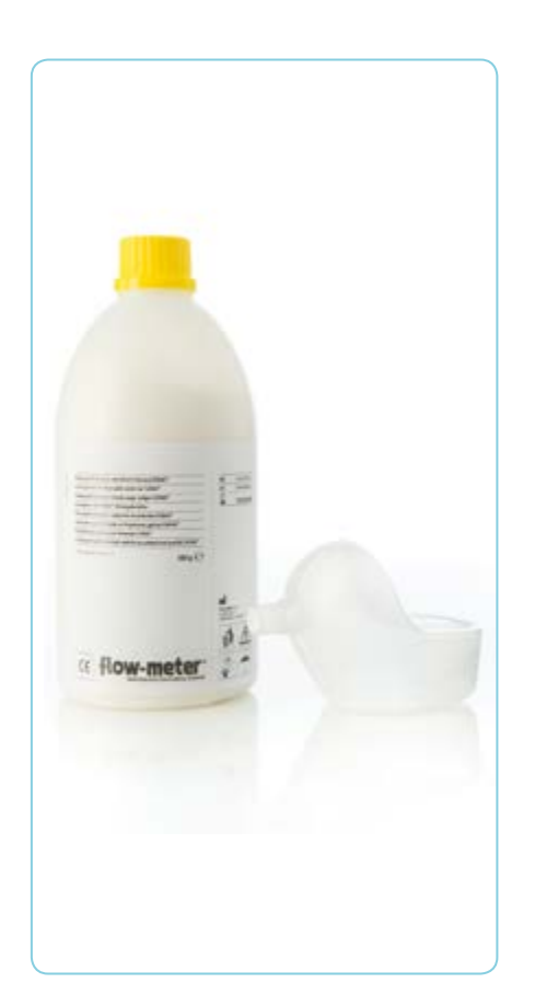
Gelling powder in 500 g. bottles with funnel/doser. 10 bottles/box