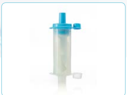
Specimen container. 10 pieces/box